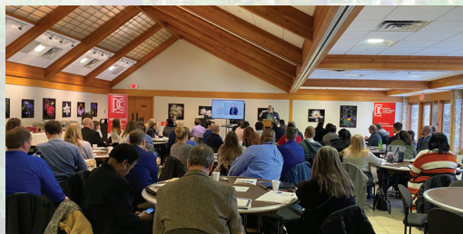
2023 Annual Meeting in the Evjue Commons Room